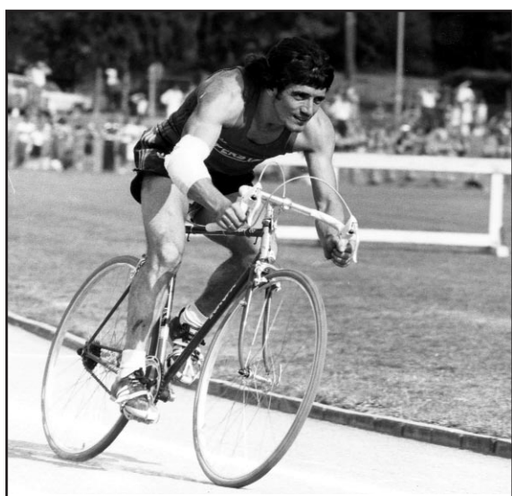
Kevin Keegan gets on his bike

Kevin Keegan came off his bike on a cinder track, and most of the skin came off his back and arms. Keegan was racing against the Belgian football captain. They both went off at a cracking speed but, suddenly, Keegan's bike touched the back wheel of his opponent's on the first bend and he came off, sliding across the track for what seemed like an eternity. Keegan wasn't worried as he was the only man in the stadium who couldn't see his back. He raced again, won, then went on to win the steeplechase and the whole event. Literally from the ashes, Keegan was champion.